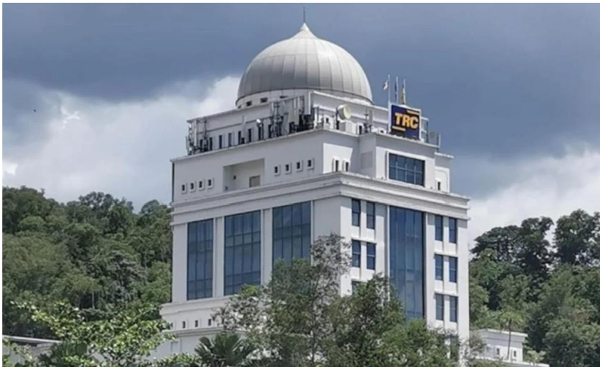
TRC Synergy Bhd